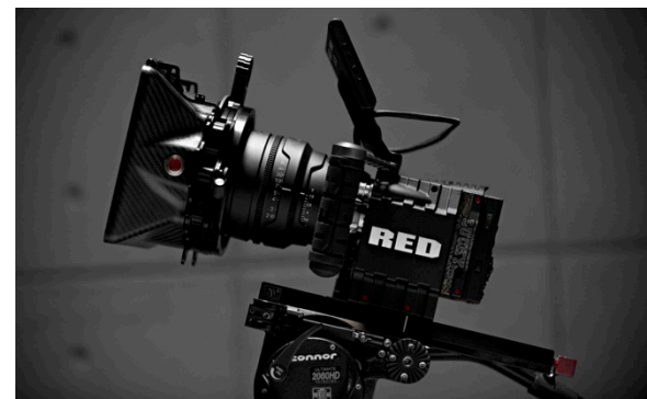
RED-Epic camera used on The Hobbit , The Amazing Spider-Man , Ender's Game